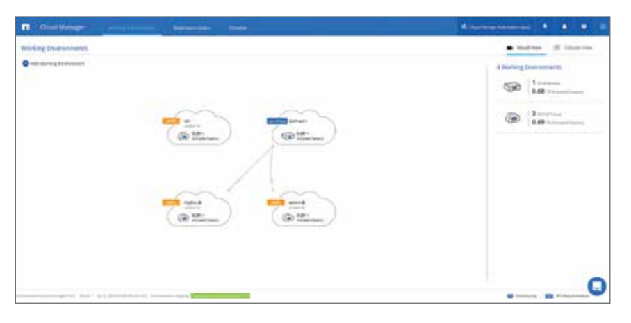
Figure 2) NetApp Cloud Manager.